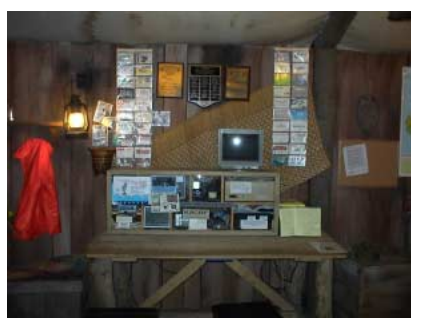
The Amateur Station at the Rain forest in Cleveland Zoo

Oh, and just to fill space, don't forget about the PA QSO Party coming up in a couple of weeks. DE KD8MQ