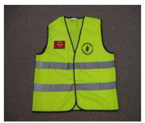
Rear view of the ARES standard vest