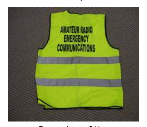
Rear view of the ARES standard vest

(This story originally appeared in the February, 2010 issue of Contact!, the ARRL public relations E-zine) for PR