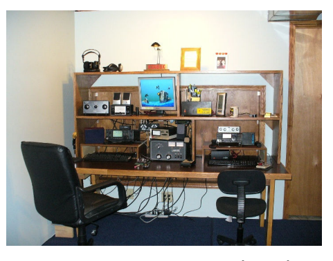
A picture Tony sent when he finished the shack

There's no word yet of damage to either home. We pray that it is minimal.