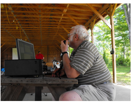
CQ 40, Where is everyone?

I guess the only thing to be decided this year is the location. Do we stay in Mahoning County, or give the folks in Stark County a run for their money? Come to the next meeting, and lets talk about it.