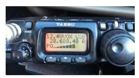
Kick ass QRP antenna setup for the ARRL 10 contest. http://youtu.be/mu_nLEU1M9c