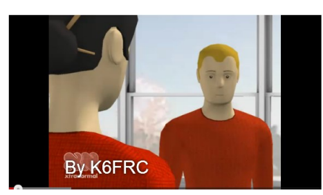
A lesson to all; Keep the spouse happy! http://youtu.be/07kirdtdI1c