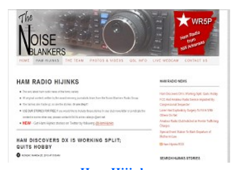
Ham Hijinks The very latest ham radio news of the funny variety.