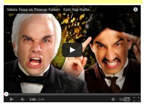
Epic rap battles of history Edison vs. Tesla

The following links are clickable Click the link, and go to those pages