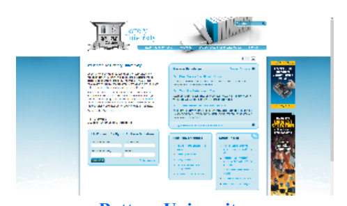
Battery University A lot of good info about batteries