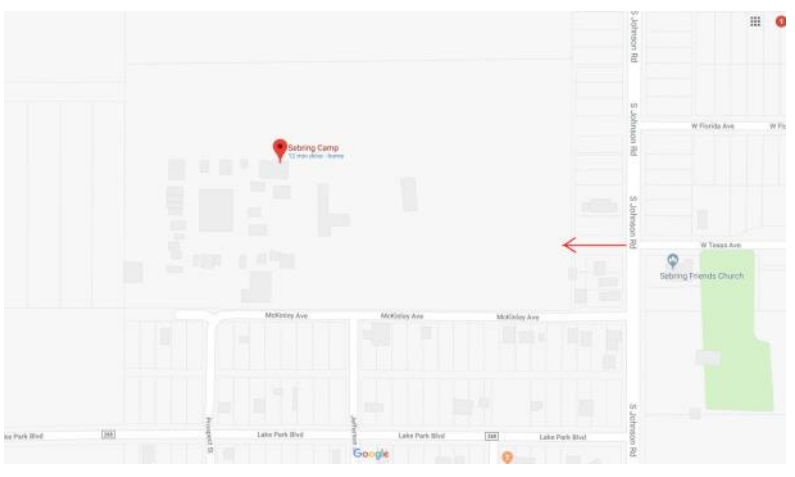
Map to Sebring camp. Note red arrow showing driveway. Click on photo to open full map.

Well, it's coming up again. Winter Field Day, that is. The big event comes up on the weekend of January 27/28. We will again be operating the club station from the Sebring Holiness Camp, on Johnson Rd (see map on this page).